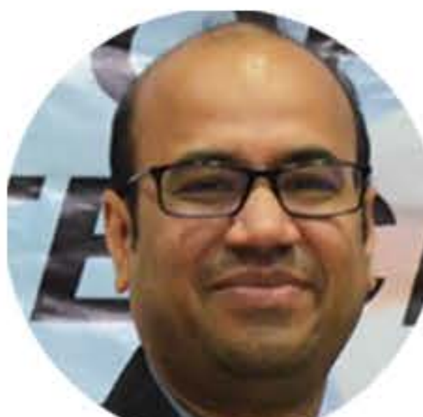
Dr. Hemant Agrawal Lab India Analytical Instruments "Full Spectrum Flow Cytometry for Immuno-monitoring After COVID-19 Vaccination and During Infection" 5:30PM - 5:50PM