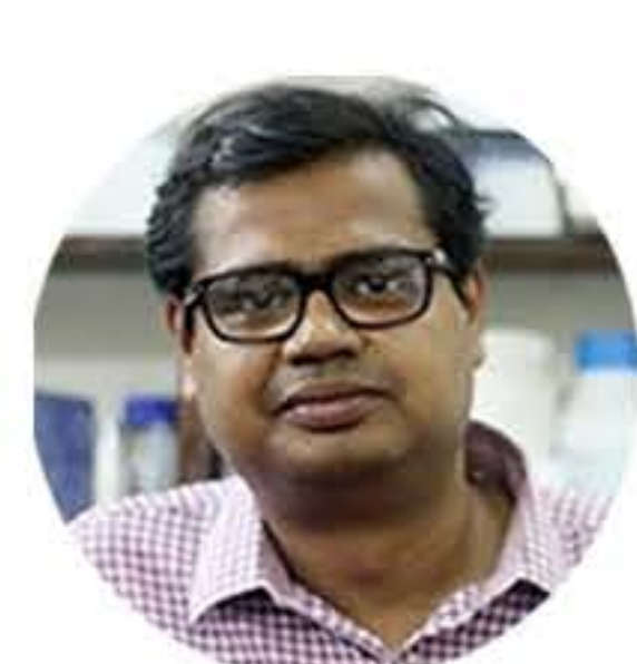
Dr. D Ganguly IICB, India "Two or three things about COVID-19 immunopathogenesis that we learnt from Indian patients" 5:00 PM - 5:30PM